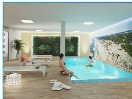
PISCINA / SWIMMING POOL

- Plano realizado sobre proyecto básico, las cotas o superficies facilitadas podrían verse ligeramente alteradas en fase de ejecución -