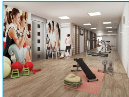
GIMNASIO / GYM