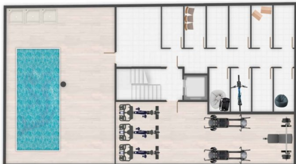
SÓTANO / BASEMENT

- Plano realizado sobre proyecto básico, las cotas o superficies facilitadas podrían verse ligeramente alteradas en fase de ejecución -