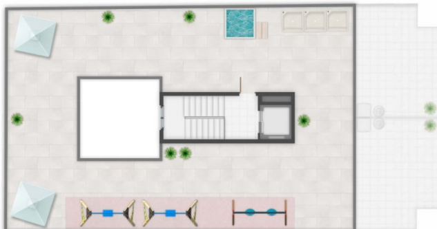
CUBIERTA / ROOFTOP