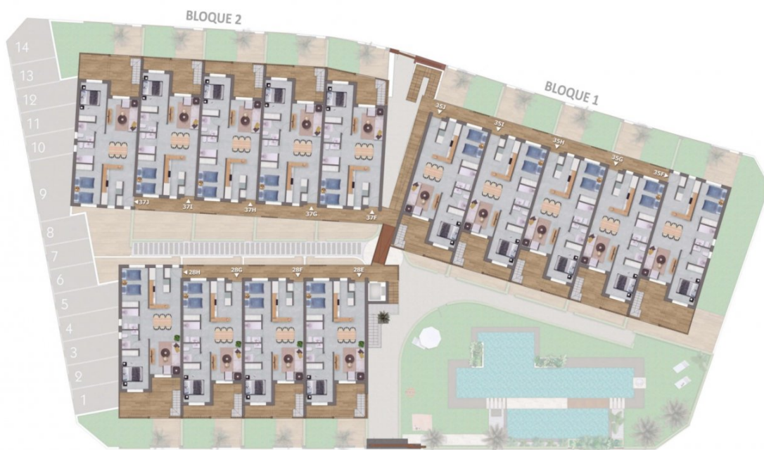
Planta Primera / First Floor