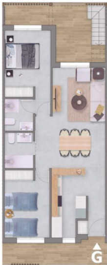
Planta primera / First Floor