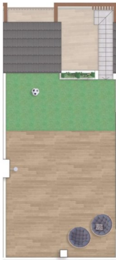
Planta solarium/ Topfloor