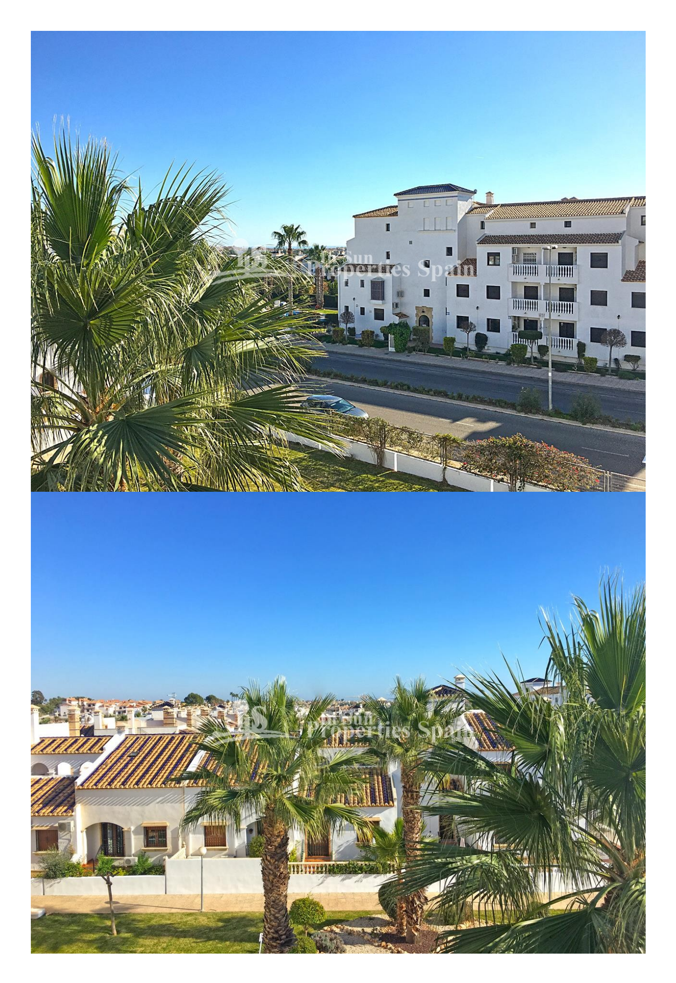
"OUR EXPERIENCE IS YOUR GUARANTEE"