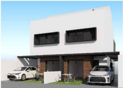
PLANO COMERCIAL PROVISIONAL. Plano sujeto a posibles modificaciones por razones o exigencias de índole técnica o jurídica.