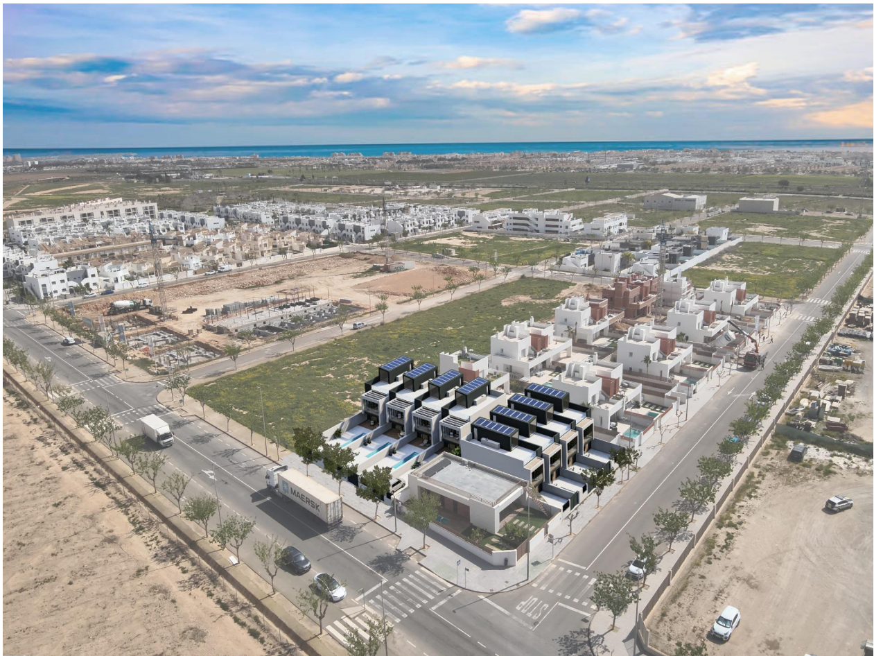
Vivienda 5, 6, 7, 8