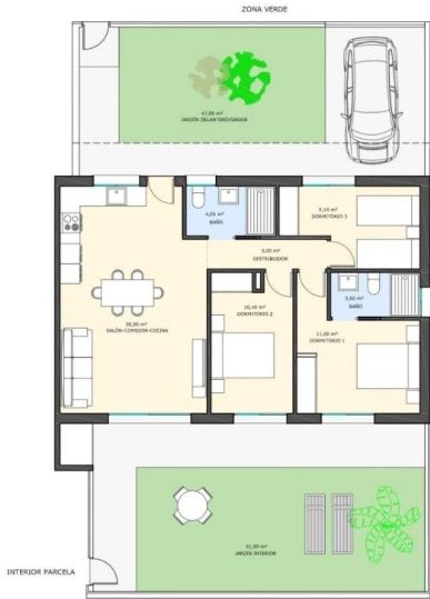
ESQUEMA PLANTA BAJA