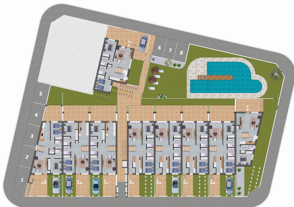
Planta baja / Ground floor

NOTA: Los planos quedan sujetos a posibles modificaciones de carácter técnico, en función del desarrollo del proyecto y de la obra, según indicaciones de la dirección facultativa. El amueblamiento reflejado tiene únicamente efectos decorativos, las dimensiones que se representan en este plano y en su leyenda son aproximadas, las definitivas serán las que resulten de la ejecución de la obra. Se hace entrega de la obra solo con el mobiliario y electrodomésticos que se indican en la memoria de cantidades. El mobiliario de la cocina y la disposición de los sanitarios puede sufrir ligeras variaciones en función del montaje definitivo.