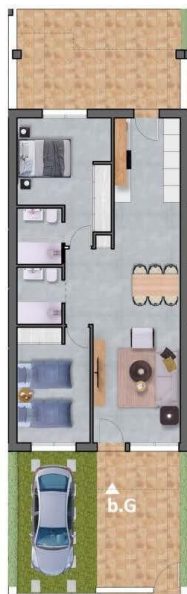
Planta baja / Ground floor