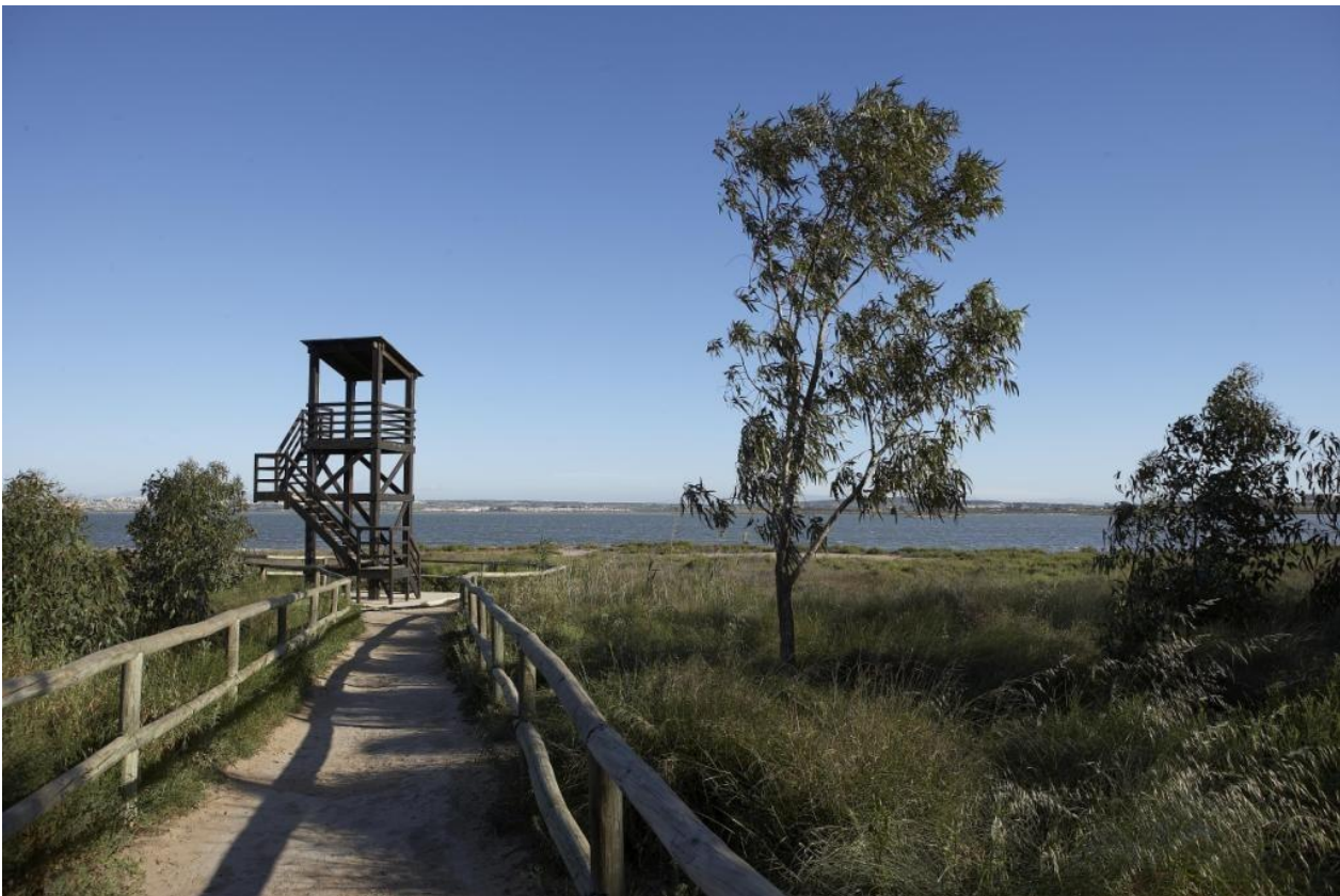
Imagen informativa sin escala / Informative image not scaled and subject to changes. Se reserva el derecho de modificaciones por motivos técnicos, jurídicos o comerciales.