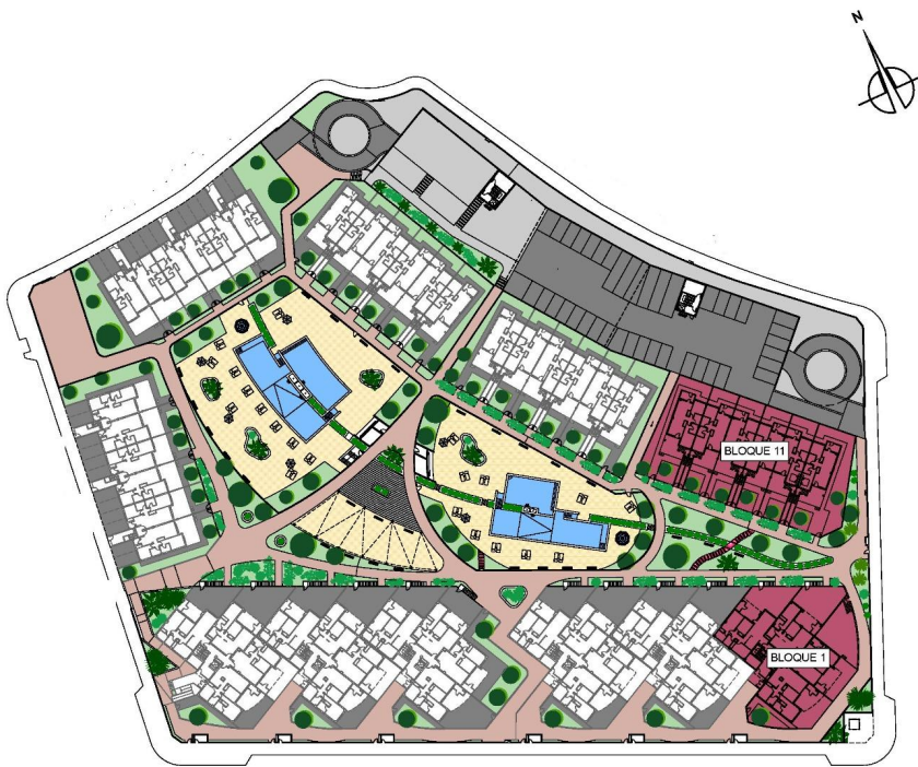
PLANTA DE CONJUNTO (FASE 1)

Este documento (tanto su parte gráfica como los datos referidos a superficies) tienen carácter meramente orientativo, sin perjuicio de la información más exacta contenida. Los datos referidos a superficies son meramente orientativos y pueden sufrir variaciones como consecuencia de exigencias comerciales, jurídicas, técnicas o de ejecución de proyecto.