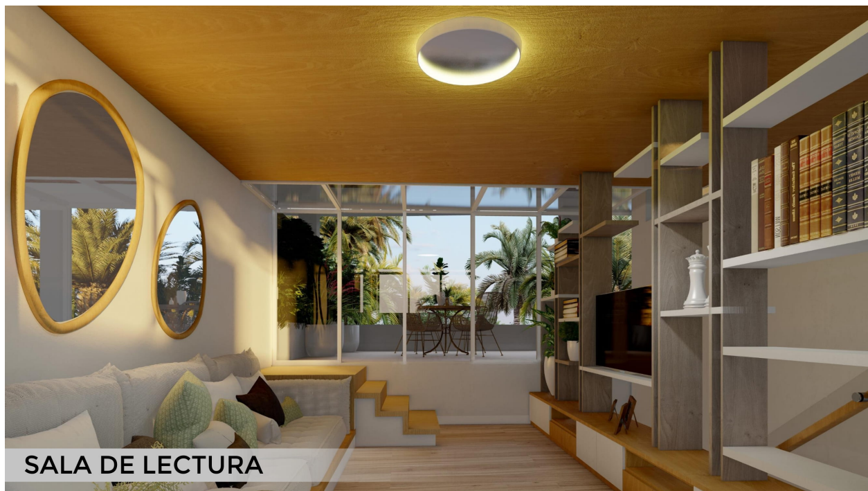
SALA DE LECTURA