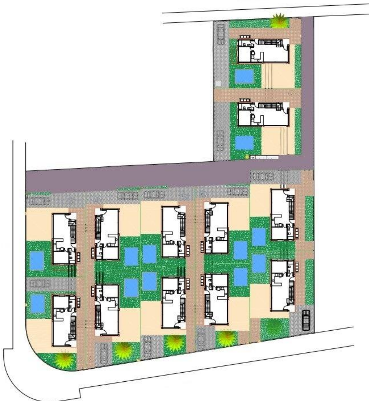
ORDENACION DEL CONJUNTO. PLANTA BAJA