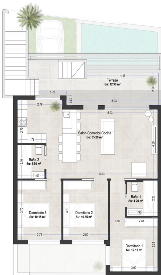
tabla de superficies