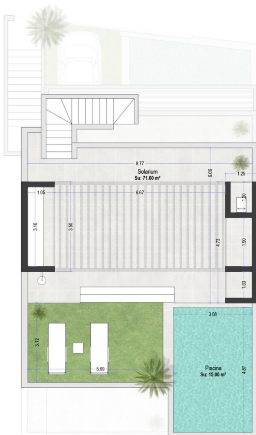
tabla de superficies