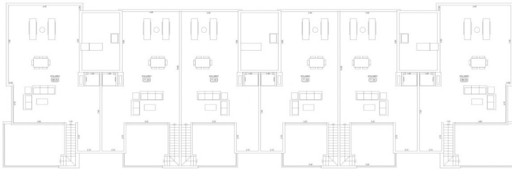
DISTRIBUCIÓN. PLANTA CUBIERTAS.