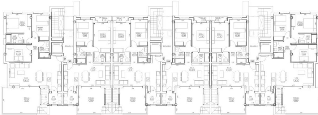
DISTRIBUCIÓN. PLANTA PRIMERA.