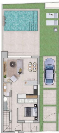
Planta baja / Ground Floor