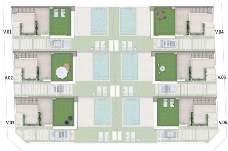
Planta Cubierta / Rooftop / Solarium