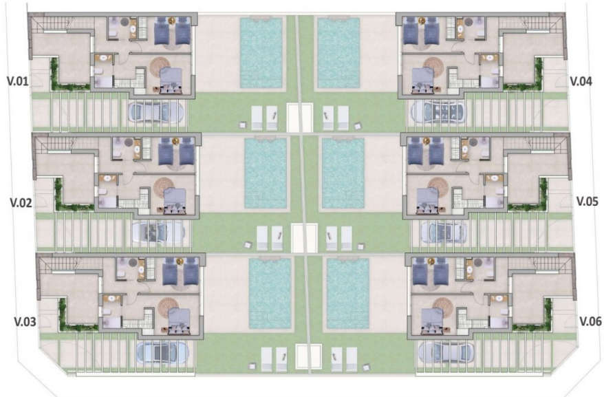
Planta Primera / First Floor