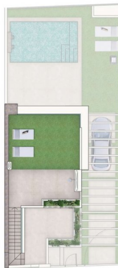
Planta Cubierta / Rooftop Solarium