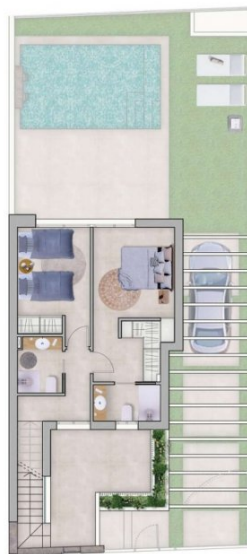
Planta Primera / First Floor