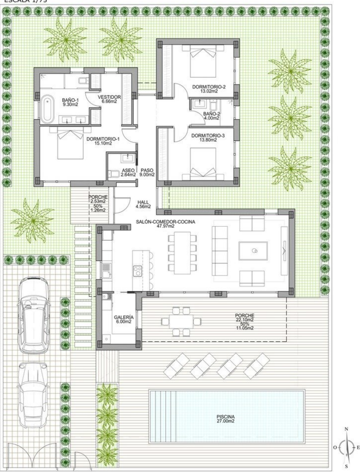
CALLE FELIPE HERNÁNDEZ 35